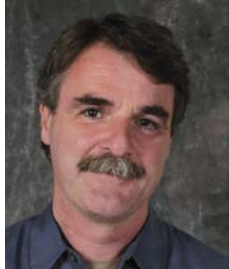
David Macaulay Artist

The 5th Annual Carle Honors Benefit Gala, on Thursday, September 30, will pay tribute to four sets of remarkable contributors in the field of children's books, in a great new venue!