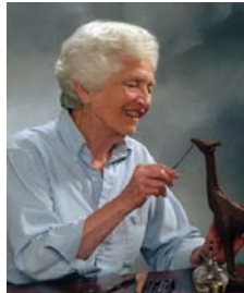
Nancy Schön Bridge