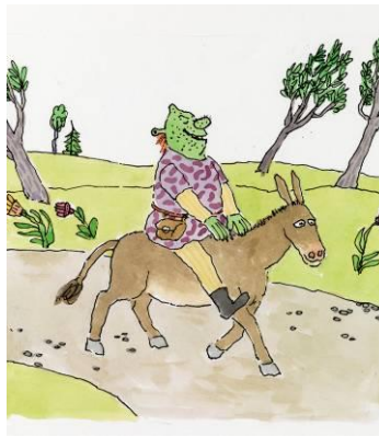
Selected illustration from SHREK! © 1990 by William Steig. Used by permission of Farrar, Straus and Giroux, LLC.

Exhibition examines the impact of Jewish writers, illustrators, and cultural traditions on picture book art